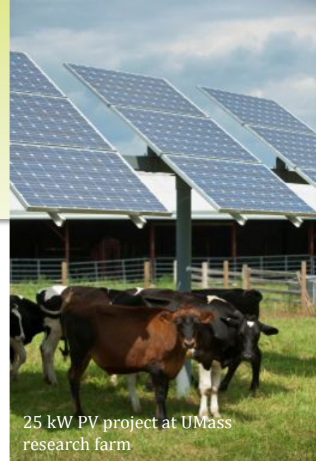
25 kW PV project at UMass research farm