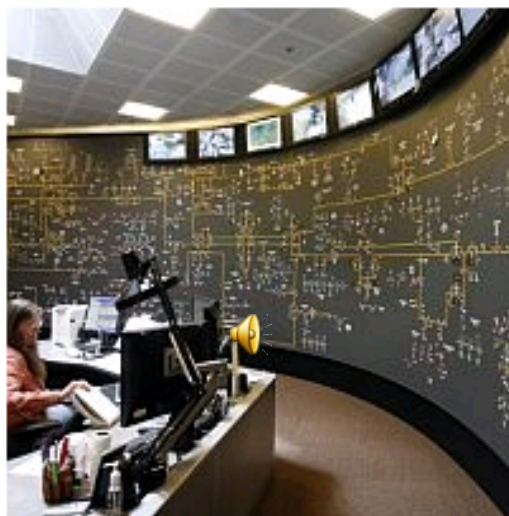
The control room at Green Mountain Power Corp.

(Host) Vermont's two largest electric utilities have reached an agreement to buy electricity from Hydro-Quebec for 26 years.